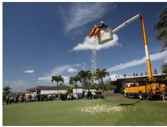
The Golf Ball drop!

For non-golfers, you can still help make this tournament a success. Buy a ticket for the Golf Ball Drop. Buy the winning ball and choose from: